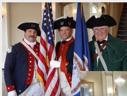
The Chapter Color Guard presented and retired the colors.