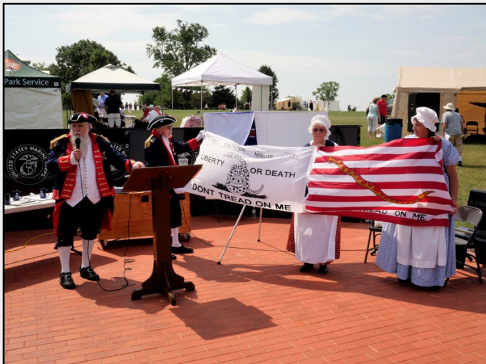
NATIONAL SOJOURNERS SHOW SOME COLONIAL ERA FLAGS