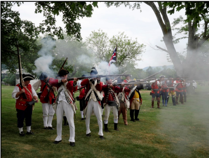
4TH COMPANY OF BRITISH GUARDS VOLLEY