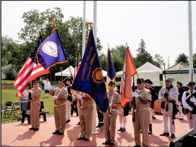
PARADE OF THE COLOR GUARDS