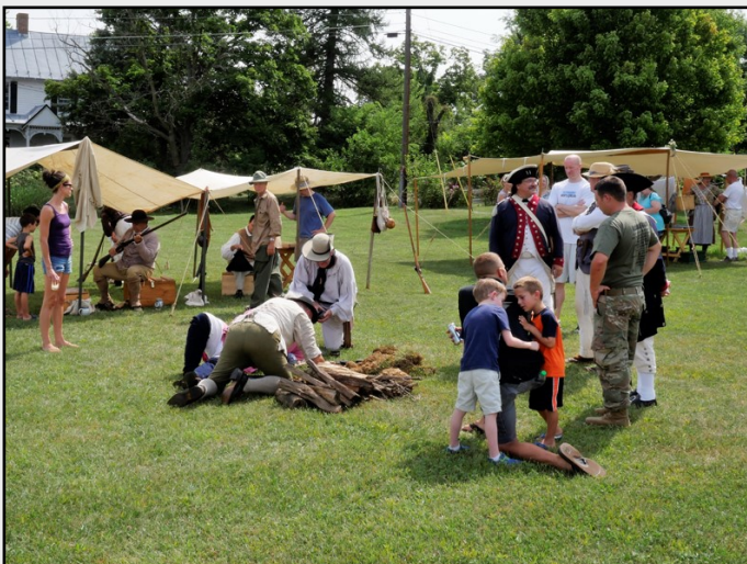
COLONIAL ARMY ENCAMPMENT