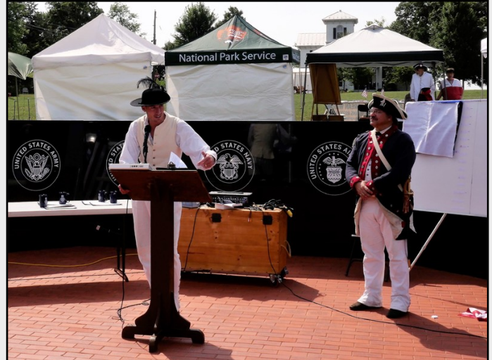
MAYOR HARBAUGH WELCOMES EVERYONE