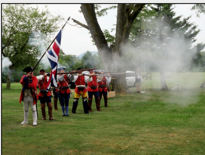
MERCER'S RANGERS IN ACTION