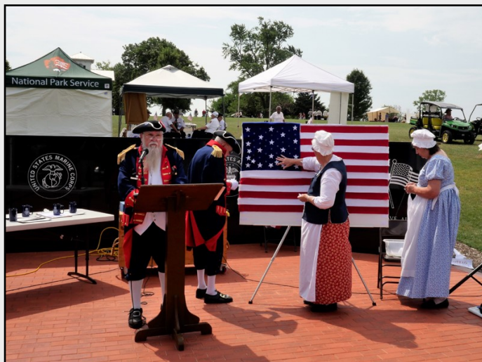
NATIONAL SOJOURNERS CONSTRUCT THE AMERICAN FLAG