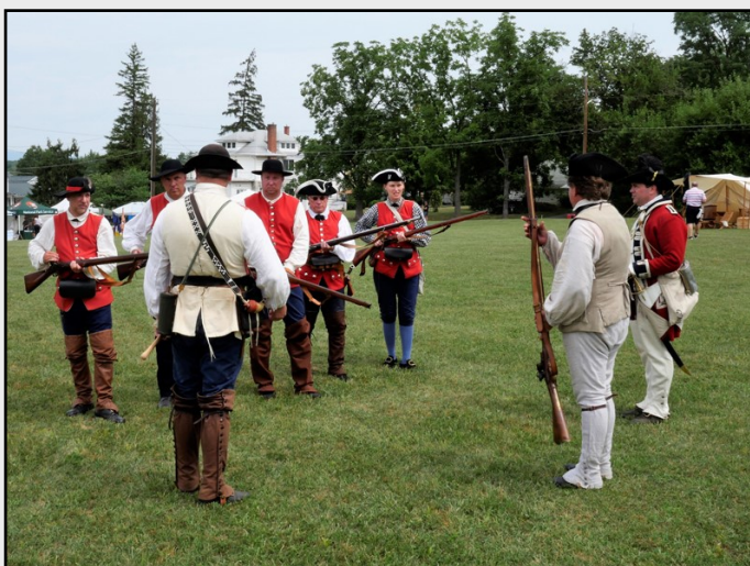
MERCER'S RANGERS RECEIVING INSTRUCTIONS