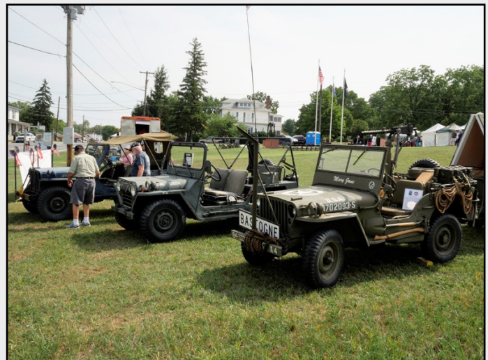
WORLD WAR II JEEP DISPLAY