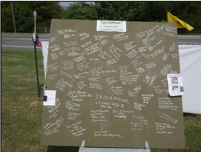
VETERANS SIGN-IN BOARD