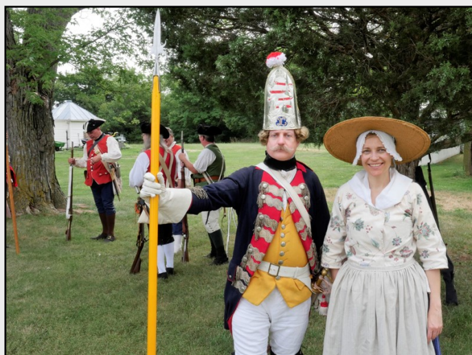
HESSIAN SOLDIER WITH HIS LADY