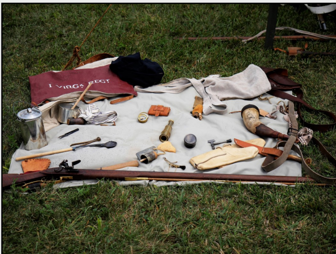
CONTINENTAL SOLDIER GEAR