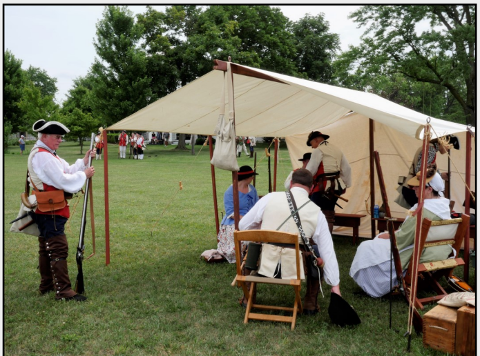
BRITISH ARMY ENCAMPMENT