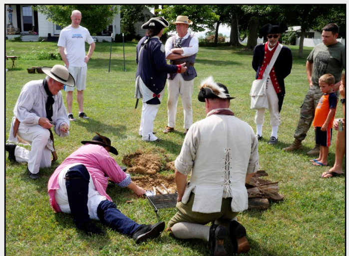
REENACTORS STARTING THE COOKING FIRES