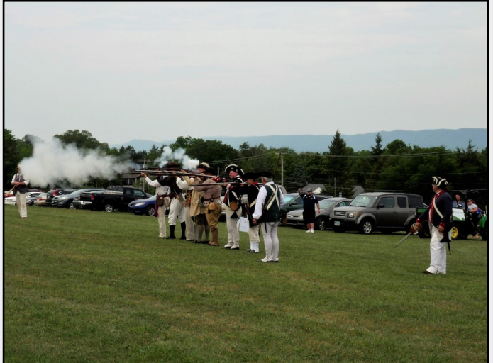
THE HOMEGUARD DEFENDING THE TOWN