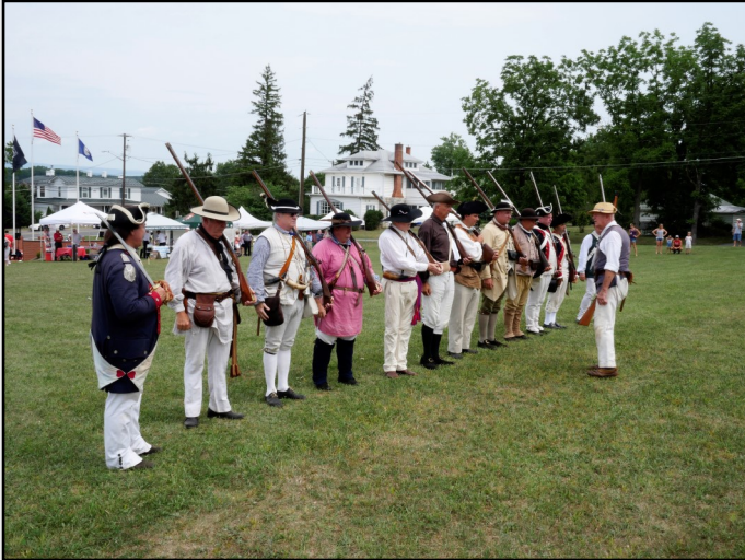
THE MIDDLETOWNE HOMEGUARD