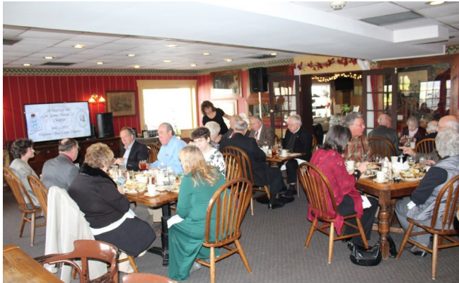
Luncheon attendees enjoyed good food, conversation, reminiscences and a presentation on 10 years of the Colonel James Wood, II Chapter